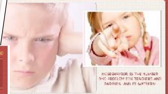
DISCIPLINE MATTERS! IS THE NUMBER ONE PROBLEM FOR TEACHERS AND PARENTS. AND IT MATTERS!